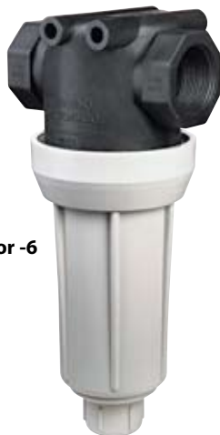
AA126ML-5 or -6