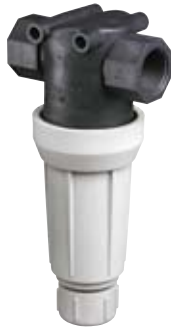
AA126ML-3 or -4