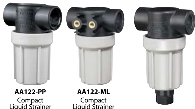
AA122-PP Compact Liquid Strainer