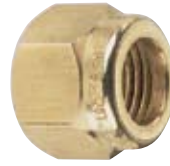
CP20230 TeeJet Cap

*Use CP20229-NY gasket when 4514-NY Nylon slotted strainer is not used.